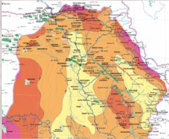
Depth to basement